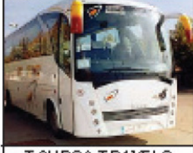
TOURS & TRAVELS

Required Single / Double / Triple Storied North/East facing building at Puri. Contact 9437143483