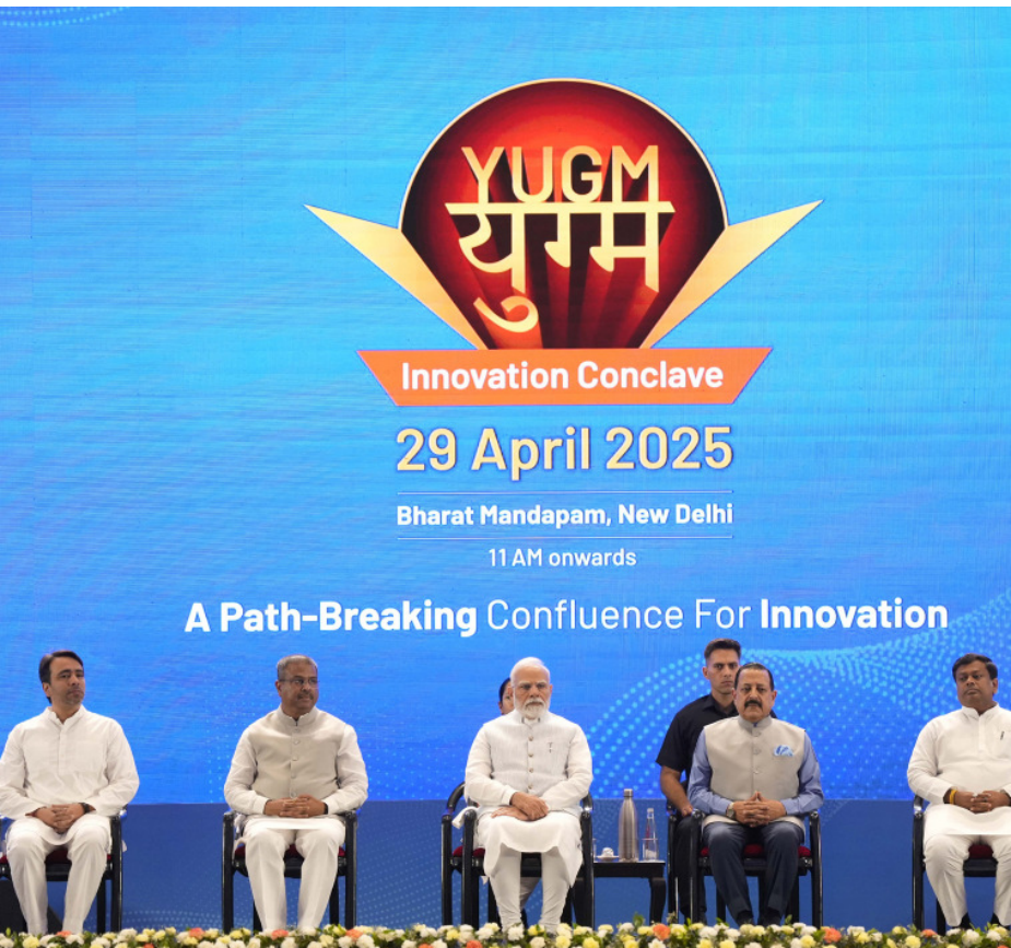
PM attends YUGM Innovation Conclave at Bharat Mandapam, in New Delhi

engineering, trade and industry, medicine, literature and education, sports, civil service, etc. 'Padma Vibhushan' is awarded for exceptional and distinguished service; 'Padma Bhushan' for distinguished service of high order and 'Padma Shri' for distinguished service in any field. The awards are announced on the occasion of Republic Day every year. These awards are conferred by the President of India at ceremonial functions which are held at Rashtrapati Bhawan usually around March/ April every year.